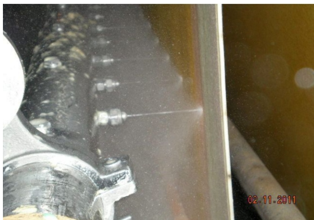
Figure 1. High pressure needle showers can effectively clean localized sections of the press fabric

change the pH throughout the press section. Figure (2) shows a comparison of the pH effect of an alkaline detergent washing of press fabrics utilizing the pulsed cleaning, versus typical conventional "on-the-run" fan shower washing. Both washes used the same alkaline fabric cleaner on a coated free-sheet machine. The impact on the pH of the press filtrate during the batch on-the-run wash is substantially greater than with the pulsed cleaning method. Large pH swings in the press section can inhibit water transport, lead to tackification of organic soils, increase press draws, and possible increases in sheet defects and sheet picking tendency.