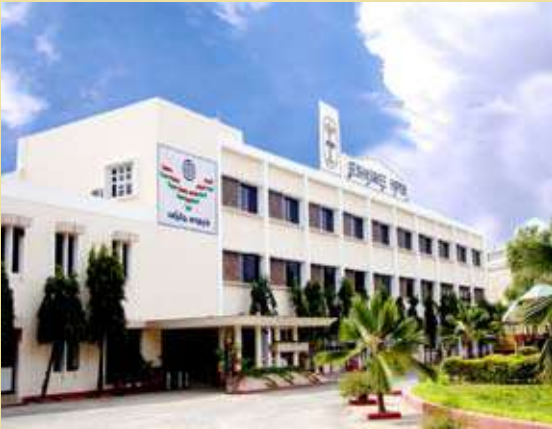
Unit : Erode